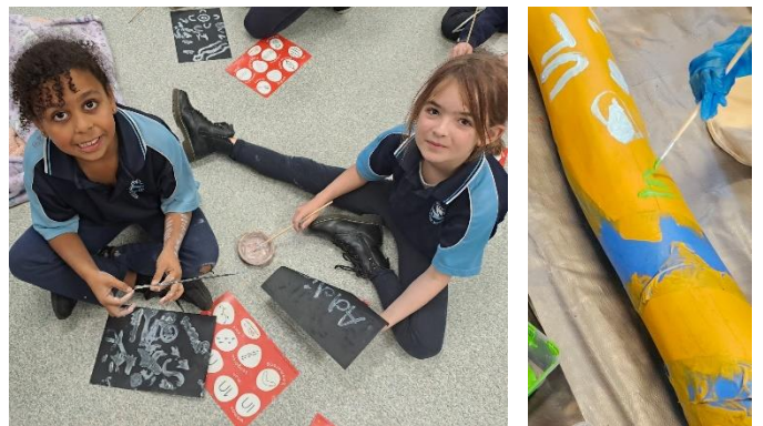
Children from Seafood Rise Primary School (above) participated in the painted cultural poles project.

Read more and see their photos: fcalliance.com.au