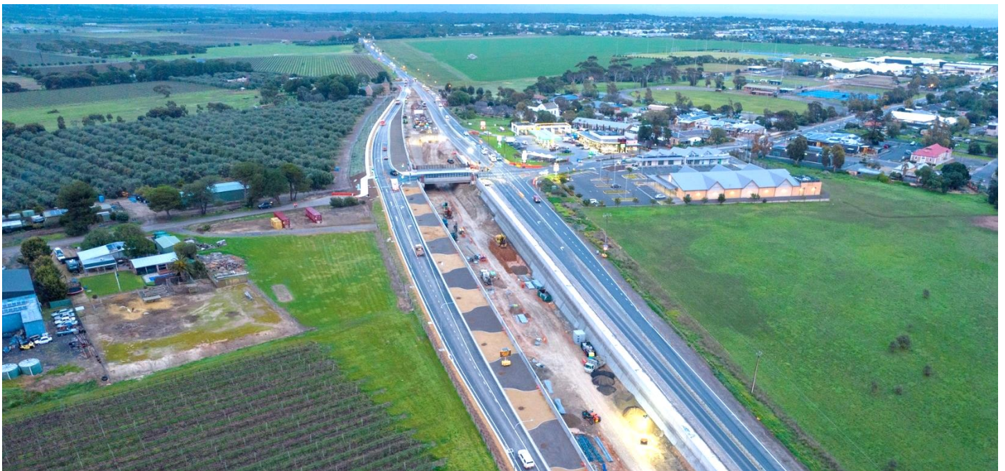
View of the new Port Road bridge, Aldinga; Main South Road Duplication Stage 1