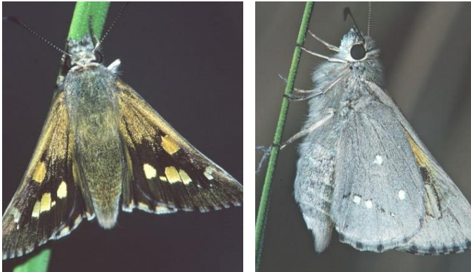
Sedge skipper butterflies