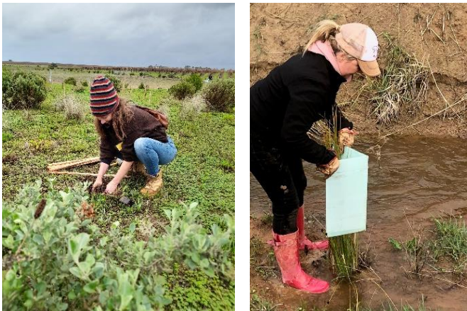
Alliance team members at the Biodiversity Shingleback Winery planting day

The project's landscaping design includes new trees and understorey plants based on advice from Biodiversity McLaren Vale to ensure species selected can be locally sourced wherever possible.