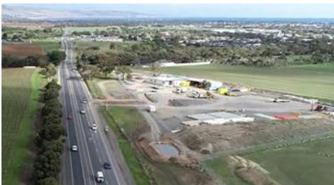
Aldinga site office Main South Road, looking south

Site compounds at Aldinga and Victor Harbor Road are now complete.