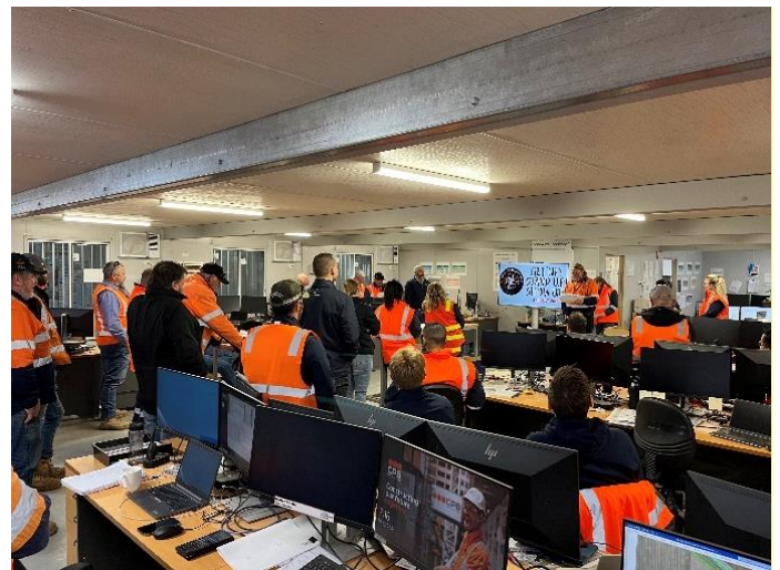
Alliance team members participating in National NAIDOC Week

During the event, this year's theme, 'Get Up, Stand Up, Show Up' was put into practice through a collaborative, workshop-style forum where the team shared and learned about how to support National NAIDOC Week and reconciliation in Australia.