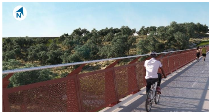
Artist impression of pedestrian and cyclist access on the western side of the new Pedler Creek bridge looking north

When the new bridge is open to traffic, the old bridge will be demolished. The Alliance is working closely with the City of Onkaparinga and Biodiversity McLaren Vale to identify opportunities to revegetate the area with local indigenous species as part of the site rehabilitation works.