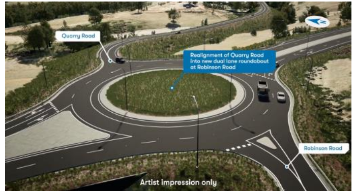
New dual-lane roundabout at the intersection of Victor Harbor Road, and Quarry and Robinson roads

Advance notice of the closure of Quarry Road has been provided to local communities and road users.