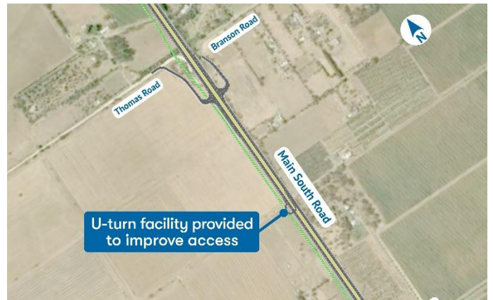
New U-turn facility south of Thomas Road