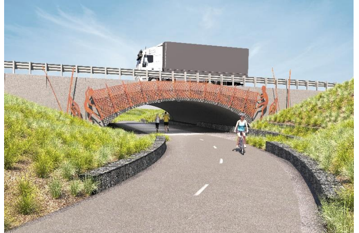
Artist impression of early Kaurna design concepts at the Coast to Vines Rail Trail underpass

These urban design initiatives will be released in the coming months.