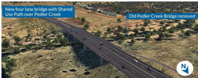
Artist impression of the new Pedler Creek bridge to be constructed on the eastern side of the existing bridge